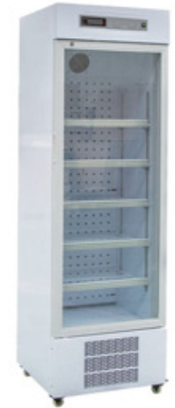
2°C to 8°C Refrigerator 【P07-22】