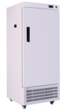
-40°C Low Temp Freezers 【P29-30】