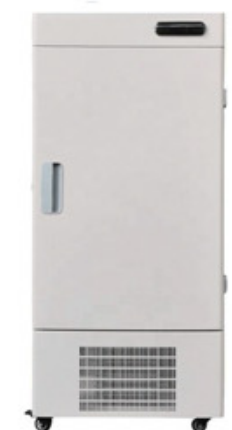
-86°C ULT Freezers 【P35-46】

GUANGZHOU MAX LABORATORY EQUIPMENT CO.,LTD. 广州麦克斯实验设备有限公司