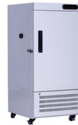
0°C to -25°C Freezers 【P23-28】