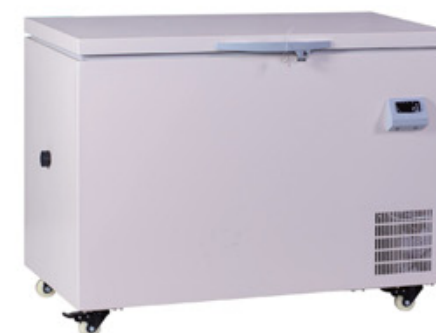
-80°C ULT Chest Freezers 【P31-34】