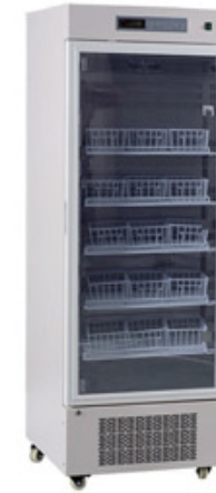
4±1°C Blood Bank Refrigerators 【P01-06】